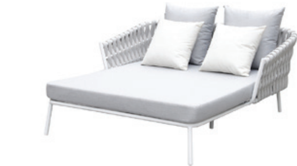
Day Bed with rope detail