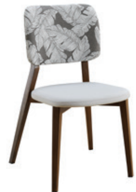
Phoenix chair with cushioned backrest and seat