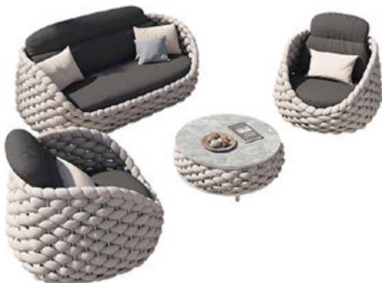
Outdoor Garden sofa set