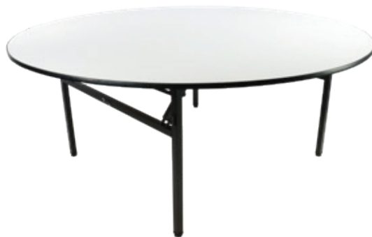
Duraurn Brooklyn round banquet table top white