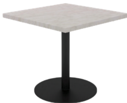
Durafurn Disco table base with square tabletop