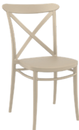
Siesta Cross chair