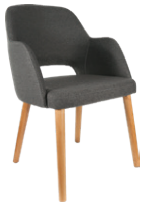
Durafern sorbet chair with oak legs