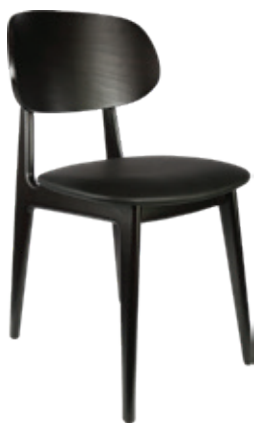
Duraful Ban chair