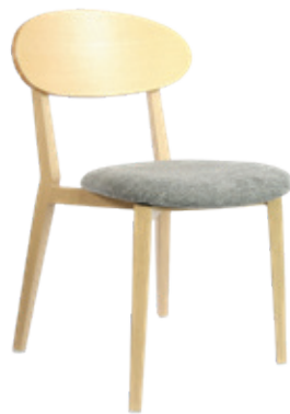
Duraful Atlanta Chair