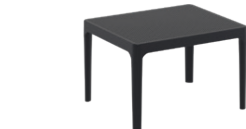
Siesta Sky side table