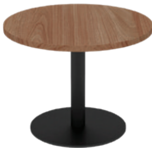
Duraful Disco coffee base with melamine round tabletop