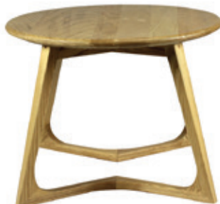
Small round coffee table