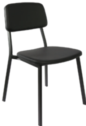
Duraful Denver chair