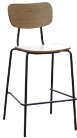
Duraful Tiramisu barstool with timber seat