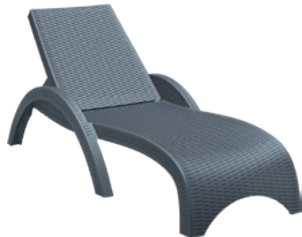
Siesta Fiji Soulounger