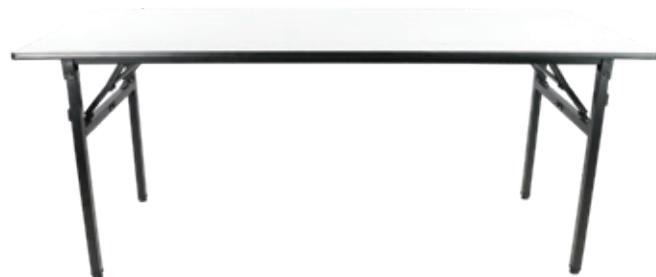
Duraurn Brooklyn rectangular banquet table