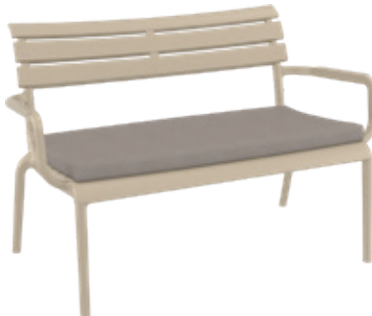
Siesta Paris Sofa lounge with cushion