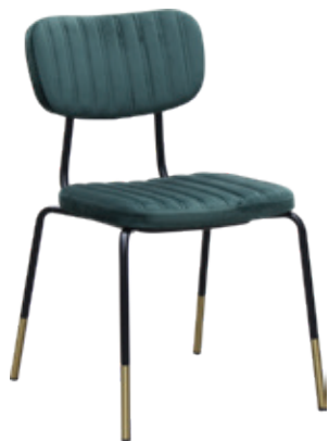
Durafurn Tiramisu chair with a black base and brass tip