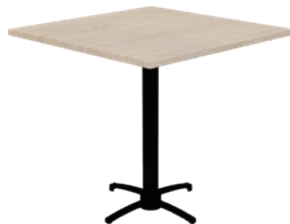
Duraurn Seattle pneumatic base with square melamine tabletop