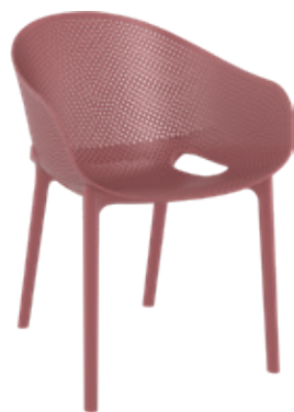
Siesta Sky Pro chair