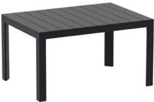
Siesta Atlantic table