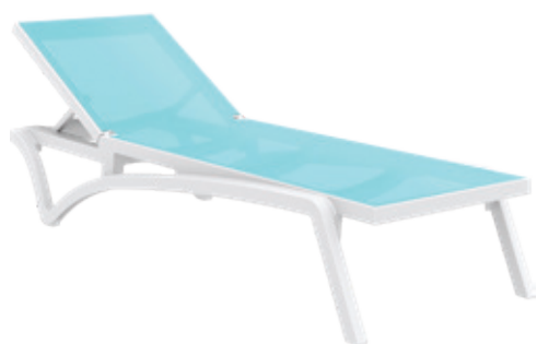
Siesta Pacific Sunlounger