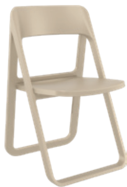
Siesta Dream Folding chair