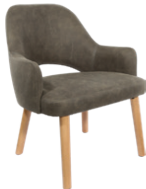
Durafern bon bon chair with oak legs