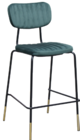
Durafurn Tiramisu chair with a black base and brass tip