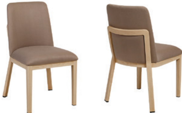
Kara Dining Chair