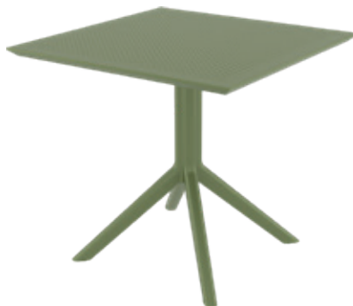
Siesta Sky folding table