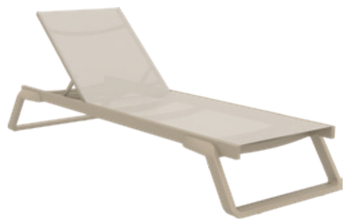
Siesta Tropic Sunlounger