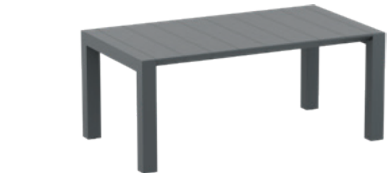
Siesta Vegas table