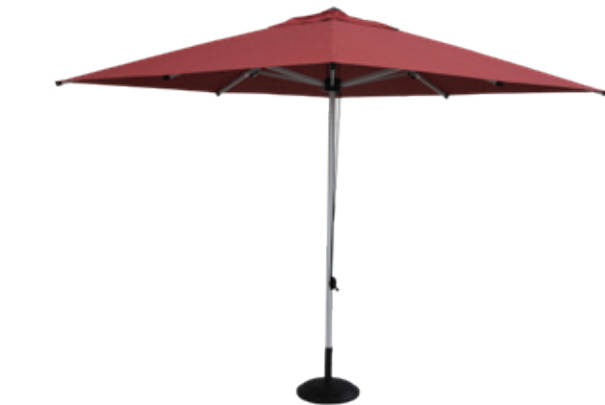
Resort umbrella with centre pole