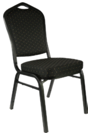
Duraurn Function chair