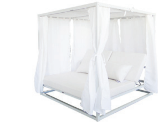
Day Bed with curtains