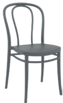
Siesta Victor chair