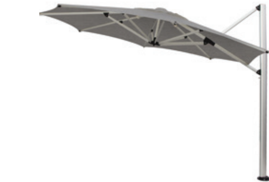
Resort umbrella offset