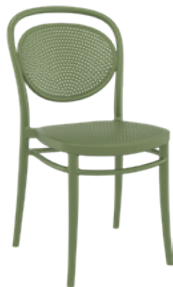
Siesta Marcel chair