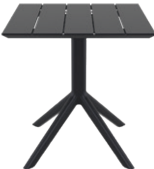
Siesta Paris Table