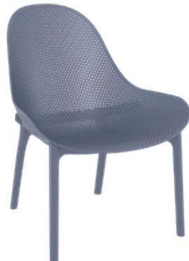
Siesta Sky Lounge Chair