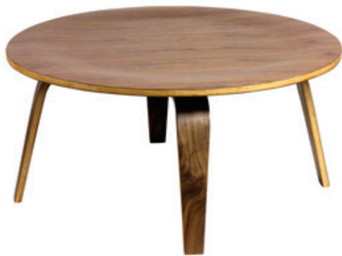
Round wooden coffee table