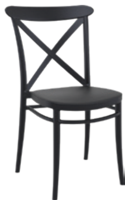
Siesta Cross Chair