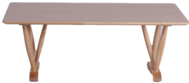
Rectangle coffee table