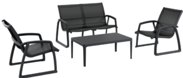
Siesta Pacific lounge set with arms