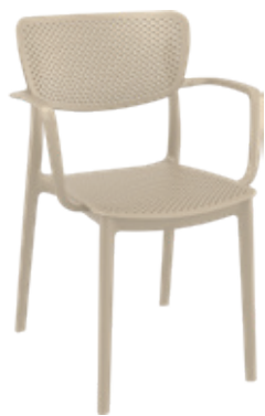
Siesta Lucy chair