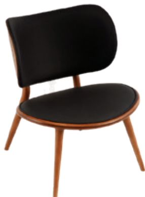
Carly leather chair