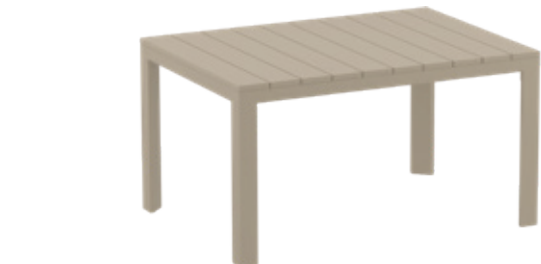
Siesta Atlantic table