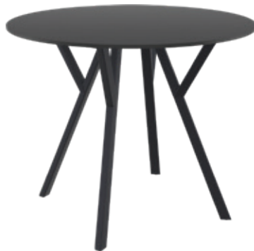
Siesta Max table 90