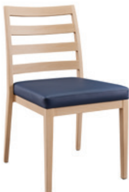
Charlotte chair with panelled backrest & cushion seat