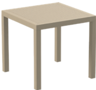
Siesta Ares 80 table