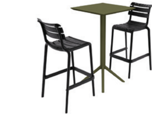
Siesta Helen barstool and folding square bar table