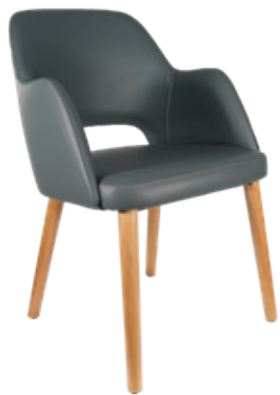
Durafurn Sorbet with timber base