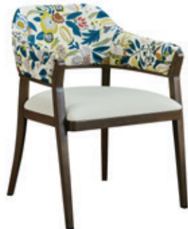
Karen chair with cushioned backrest and seat