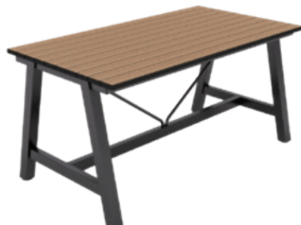
Durafurn A-frame table with compact laminate tops