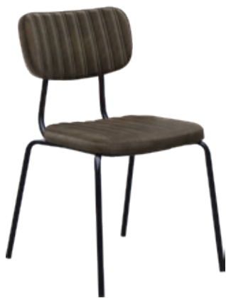
Duraful Tiramisu chair with upholstered seat & black frame