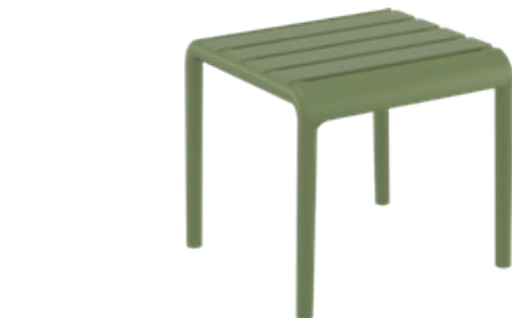
Siesta Paris side table