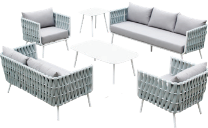
Outdoor Garden Lounge Setting