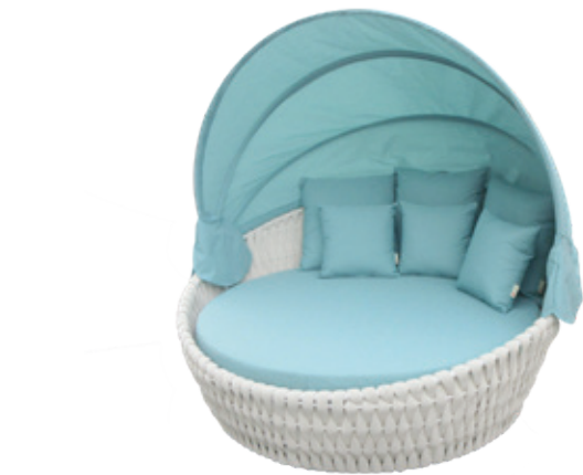
Day Bed with Sun Shade options and colours