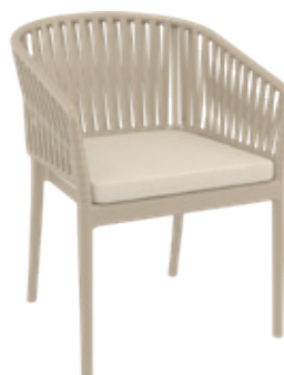
Siesta Portofino Chair