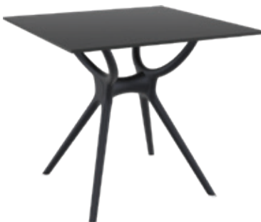
Siesta Air Table Black