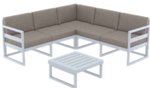
Siesta Mykonos corner set & cushions