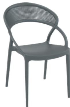
Siesta Sunset chair