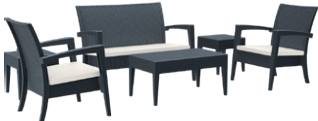
Siesta Tequila lounge set