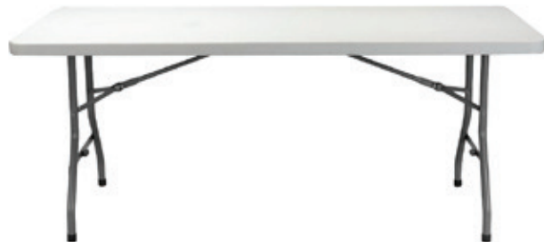
Manhattan Banquet table rectangle