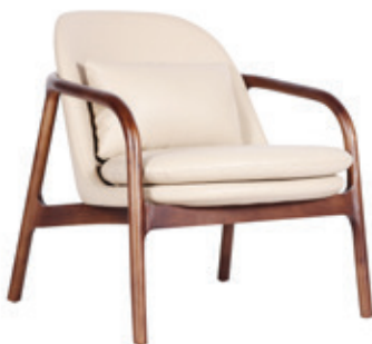
Alexia lounge chair