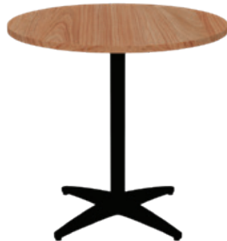
Durafurn Astoria base with melamine round top