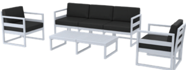
Siesta Mykonos lounge set with cushions and side tables