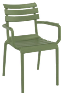
Siesta Paris Arm chair