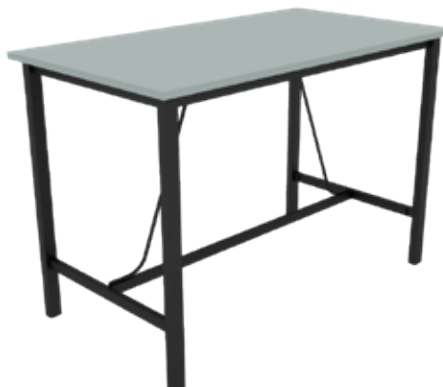
Durafurn Spire bar height frame 1050mm with melamine rectangular tabletop