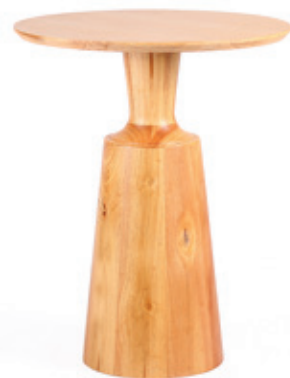
Wooden round coffee table