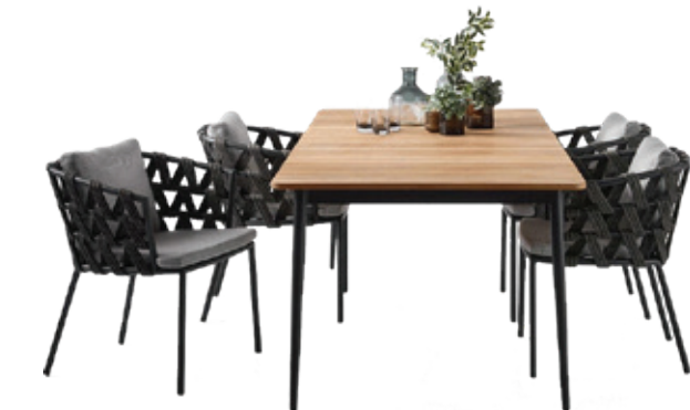
Luxury Dining Setting