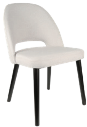
Duraful Semifreddo chair with timber base