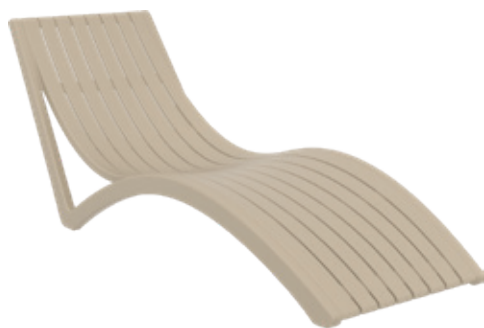
Siesta Slim Sunlounger