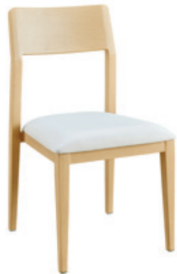
Arthur chair with cushion