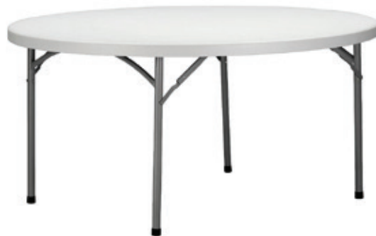
Manhattan Banquet table round